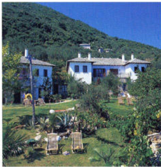
WORDS BY JUNE FELD

DANAI BEACH RESORT & VILLAS (0030 23750 22310), Sithonia, Halkidiki. THE ROMANCE FACTOR: A hideaway overlooking golden beaches. If the picnic cruise doesn't grab you, go to the helipad for a flight across Greece. THE BED TEST: With its opulent furnishings, you'll be seduced by this resort's beautiful suites. DETAILS: Mediterranean Experience (020 8445 6000) offers seven nights B&B for £880 per person including flights. A pool suite, starts from £1385 until 25 June.