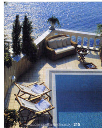
www.cosmopolitanmagazine.co.uk • 215

TSITOURAS COLLECTION (0030 22860 23747), Thira, Santorini island. THE ROMANCE FACTOR: Of Tsitouras' six suites, the House of Nureyev penthouse with its private veranda and sunset views, is the one to go for. Within walking distance of the village of Thira, it clings to a 1000ft cliff and overlooks a string of volcanic islets. THE BED TEST: Expect über-sumptuous furnishings, black bedspreads, elegant brass fittings, low lighting, and linen with gilded olive wreath monograms. DETAILS: One night B&B for two in the House of Nureyev starts from £360 and includes local airport transfers. Visit www.tsitouras.com