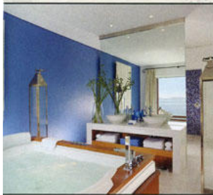
OPPOSITE PAGE: Stunning views across the Aegean to the island of Delos THIS PAGE CLOCKWISE FROM TOP LEFT: Outdoor terracing makes the most of the view; as does the infinity pool; newly upholstered furniture and fresh paintwork have added a more romantic feel; poolside linen pavillion; teak jacuzzi bathtubs