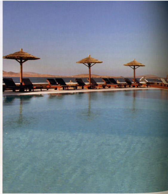
Left to right: The resort steps down to a private beach The traditional wooden pergola near the pool houses Aqua e Sole restaurant Glorious Signature Seafront Massage is done with views of the Aegean